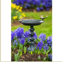
PEDESTAL BIRD BATH