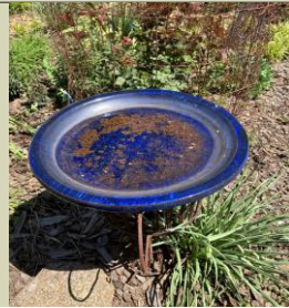
CLEAN OUT EVERY FEW WEEKS!