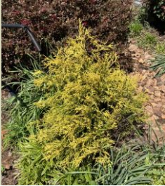
CHAMAECYPARIS- FALSE CYPRESS