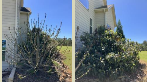
FIG AND LOQUAT